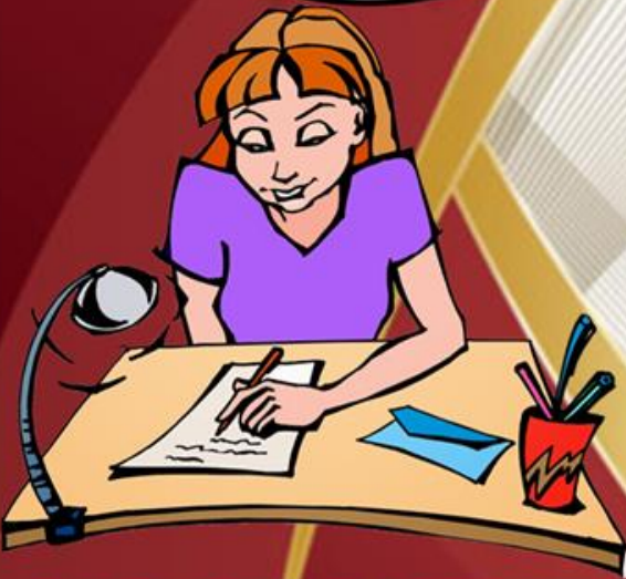
SCRAPBOOK STORY REPORTER